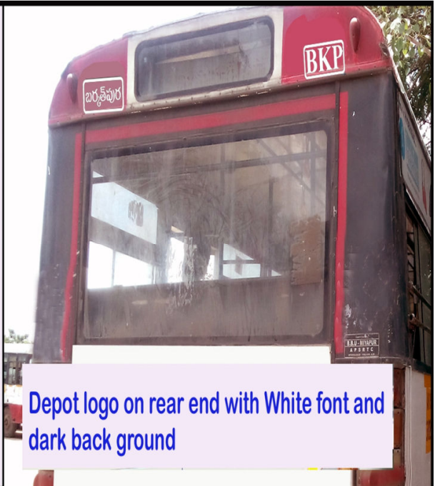
Depot logo on rear end with White font and dark back ground