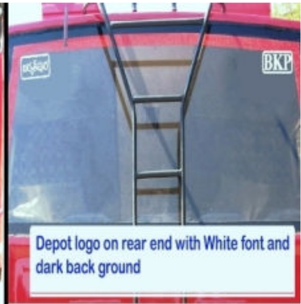
Depot logo on rear end with White font and dark back ground