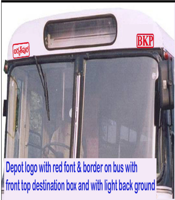
Depot logo with red font & border on bus with front top destination box and with light back ground